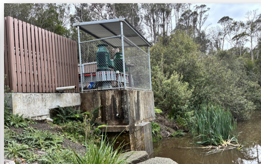
Brid River water intake