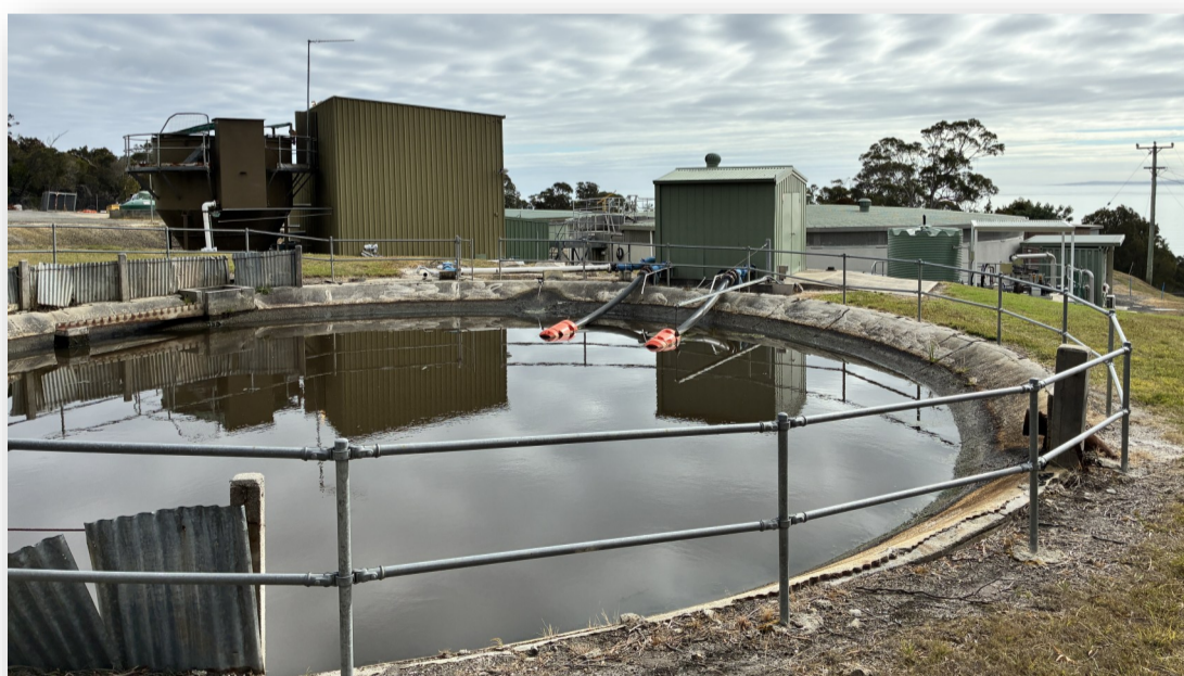
Bridport water plant

An ideal solution would seem to require heavy capital investment. That now looks improbable. So, if Council’s proposed Bridport structure plan identifies significant growth areas for Bridport, creative solutions are going to have to be found for adequate waste-water and sewerage solutions.