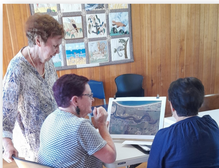
CWA members checking out the map

The group is indebted to all the volunteers including the CWA.