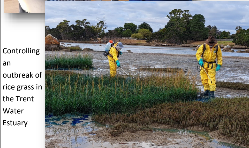
Controlling an outbreak of rice grass in the Trent Water Estuary