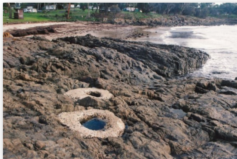
Relics of the original tramway jetty at Croquet Lawn Beach

The visitors commented favourably on the unusual character of a seaside town with a foreshore largely untrammelled by building development. "We'll probably revisit next year, so keep your ears pricked", said the piper.