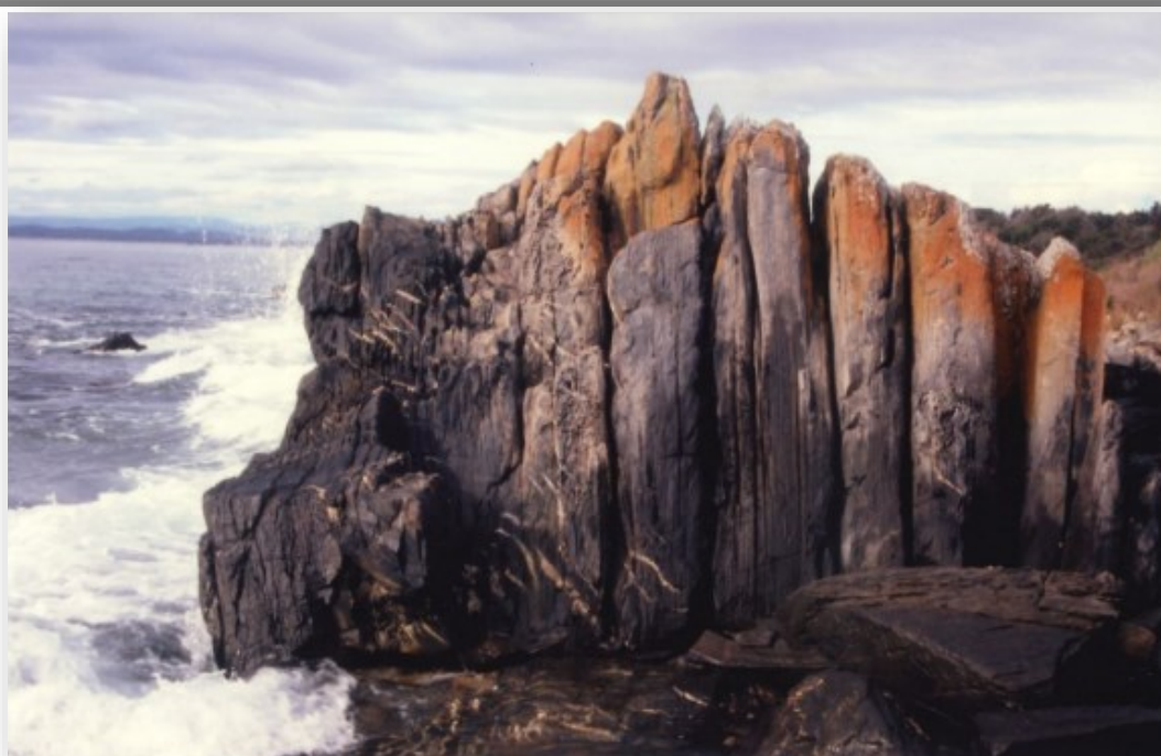
Photo: Upturned strata at East Sandy Point

The upheaval has the fearsome name ‘Tabberabberan Orogeny’. Orogeny means mountain building. Tabberabbera is a small place in eastern Victoria where the effects are clearly seen.