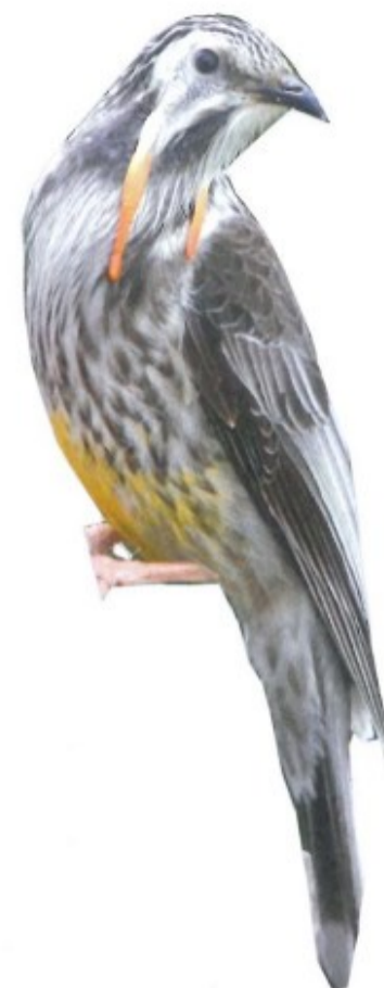
The yellow wattlebird

Wattlebird pie was once a popular dish in rural Tasmania and the birds were hunted almost to extinction. Numbers have rebounded since the bird was afforded protection after the last open season in 1972.