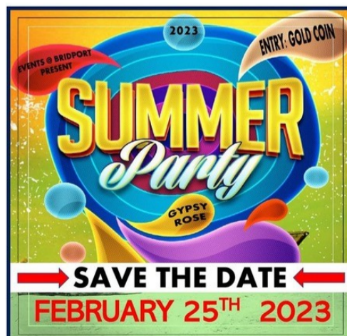
Bridport CWA Village Market entertainment