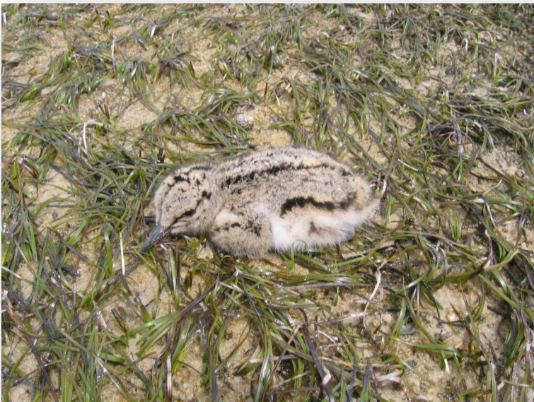
A chick unable to fly, which left the nest after being chased by a dog