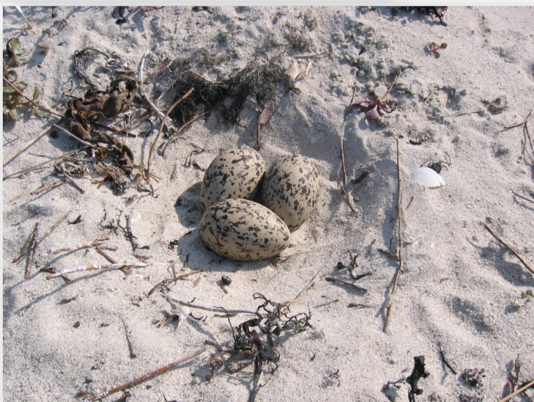
Nest - Just a scrape in the sand