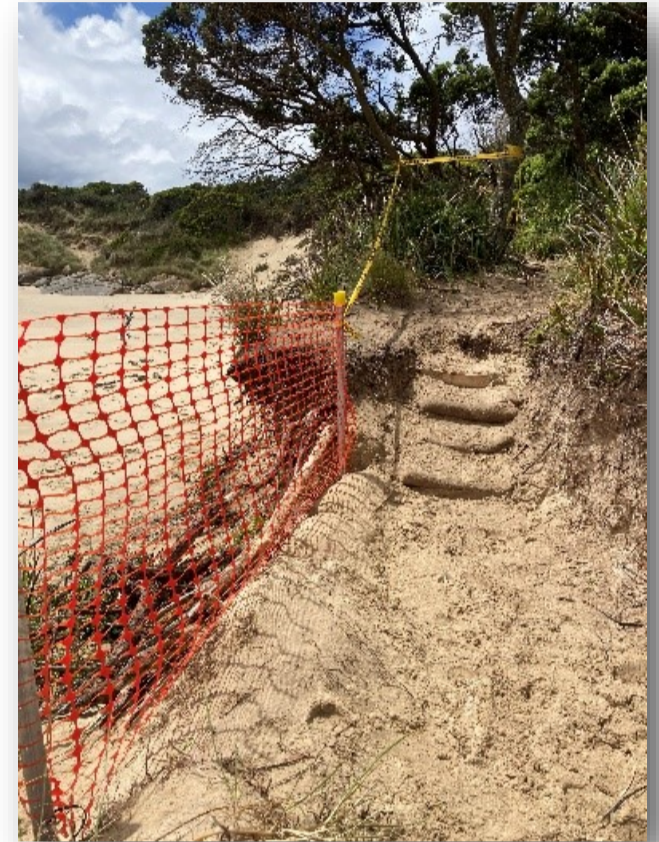
The recently repaired access to Adams Beach

The Pavilion Visitor and Information Centre is open every day from 10 am - 4 pm for maps, information, crafts, tennis racquet hire, book swap etc. There will be a variety of activities and events in the town over the summer period which are mentioned in this BridReport or will be advertised around the town so look out for what's on and make the best of summer in The Village by the Sea.