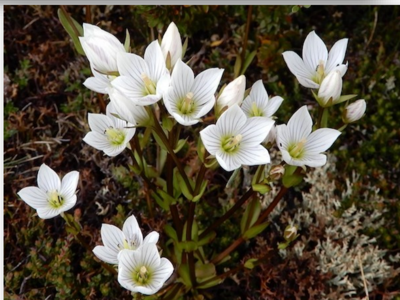
Mountain gentian