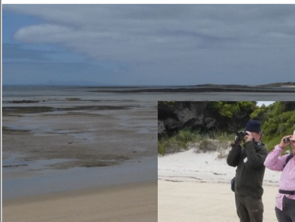
Report and photos by Lou Booker

Woolnorth Renewables enabled the North East Field Nats to visit Cape Portland to make their own observations. The migratory shore birds were 'shore' hard to see in the vast expanse of open mudflats there, but with patience and good binoculars, they were able to spot and identify four species which had returned from their migration. The smallest and most difficult of these to see was the Red Necked Stint, a mere 14 centimetres long. The Ruddy Turnstone was a little easier to see at 23 cms long. Both these species have returned from nesting in the Siberian tundra. The Double Banded Plover was also seen, but it is unusual in that it migrates East/West and flies to and from New Zealand.