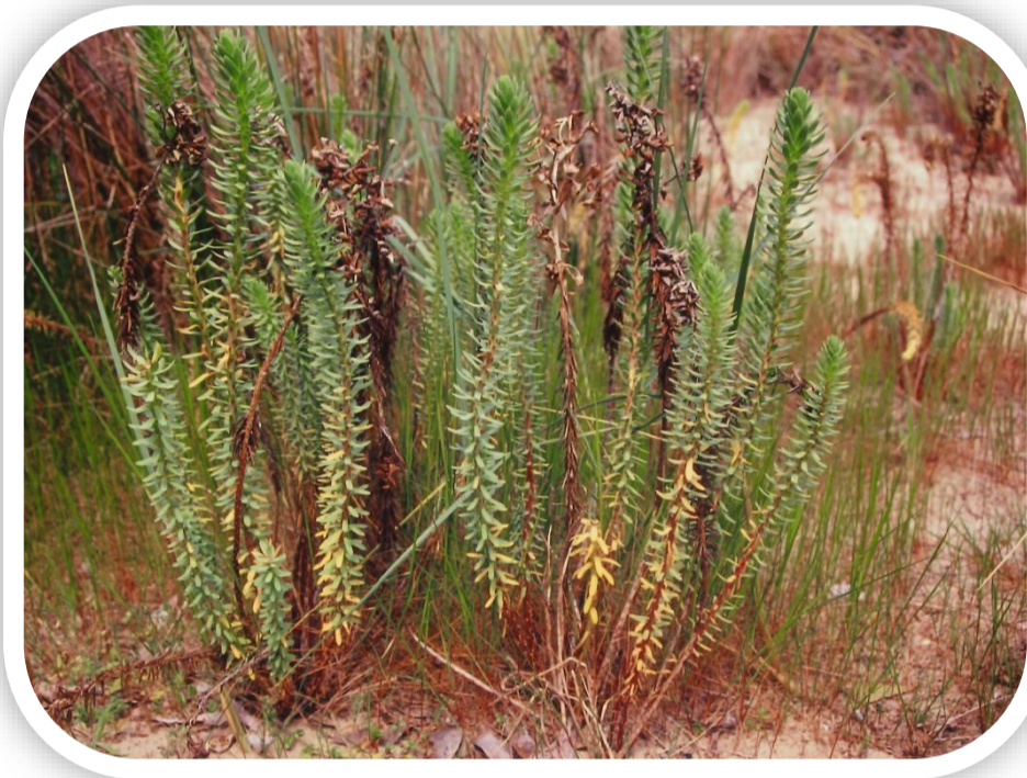
Sea spurge, Goftons Beach

For many years Bridport Coastcare kept it in check at Adams Beach. With a hiatus in coast care activity the sea spurge has taken over sandy tracts behind the northwestern end of this beach.