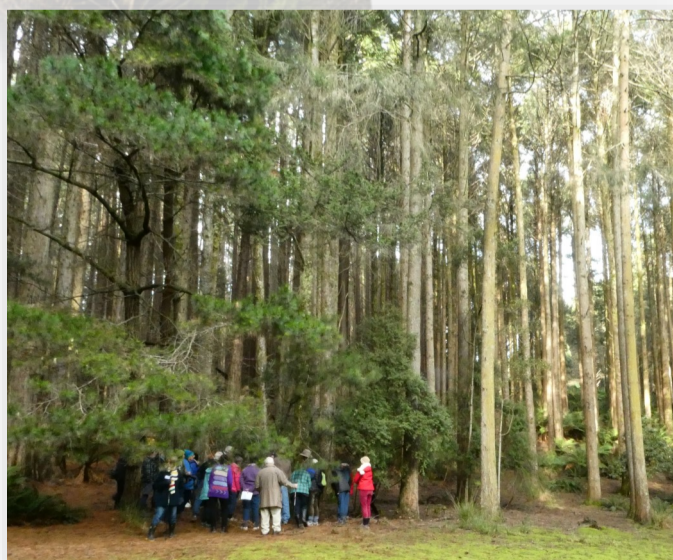
Field Nats at Springfield amongst the Douglas Fir