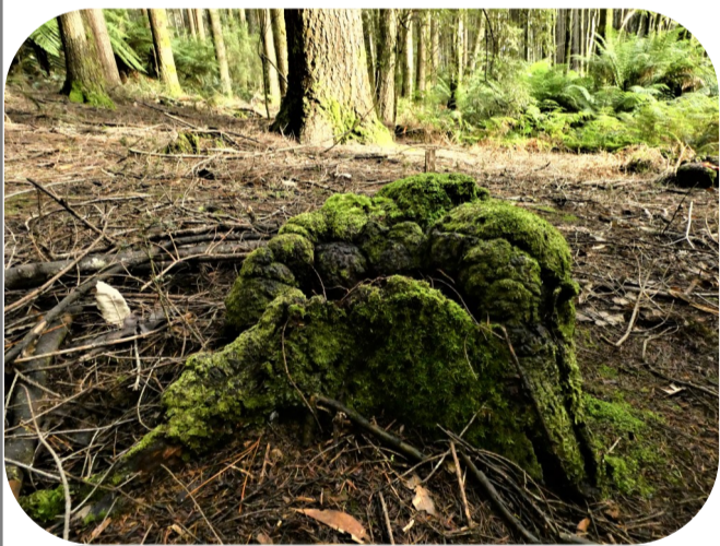
Forty year old living stump