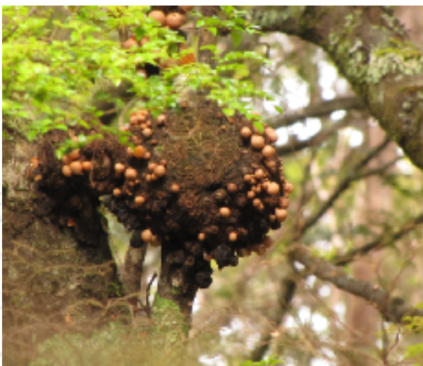
Myrtle Oranges developing on a gall

Lou Brooker: 0417 149 244 to register attendance.