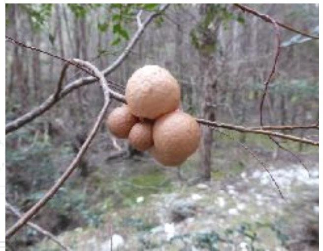
Myrtle Oranges: Cytarria gunnii