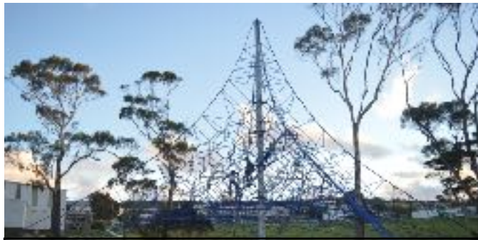
Bridport Playground Star Net ready for the holidays

YOUR COMMUNITY NEWSLETTER KEEPING YOU UP-TO-DATE WITH THE LATEST EVENTS IN BRIDPORT