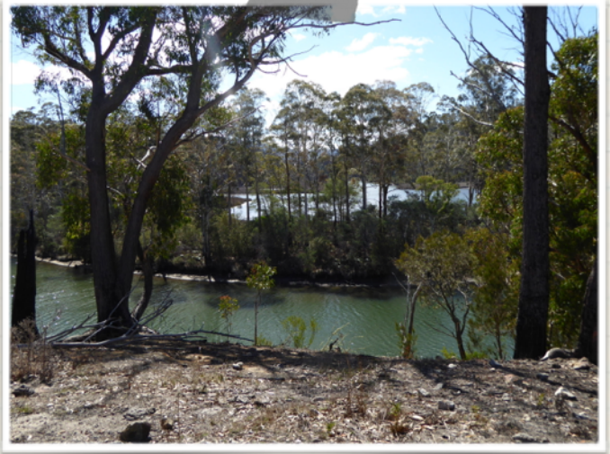
Four kilometres inland, the river twists and turns forming mudflats and saltmarshes.

At the recent outing to the Scamander River, the group heard about the dramatic history of the river at its mouth where, since the first bridge which was built in 1885, subsequent bridges have only lasted an average of nine years, whereas the bridges on the Huon and the Prosser Rivers have lasted an average of 30 years. Massive floods, subsidence into quicksand and erosion from strong tides have been some of the causes. One bridge only lasted 12 months.