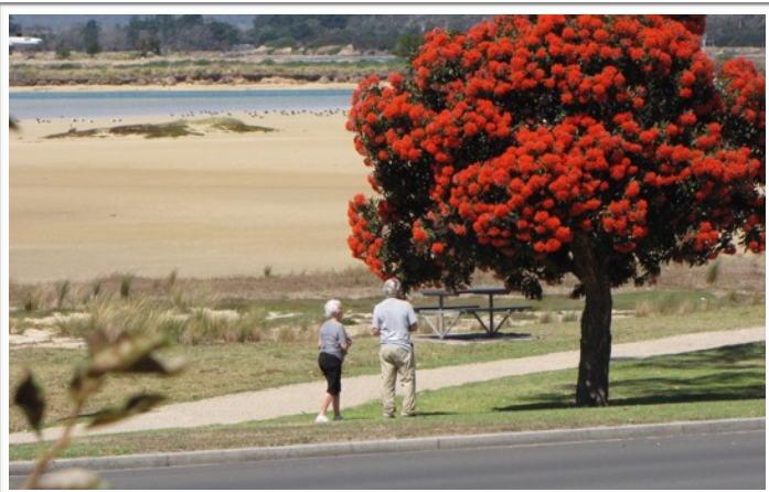
Is this the most photographed tree in Bridport this year? Many people have stopped to take a photo. From walkers and cyclist to visitors in motor homes. One lady even brought her secateurs and took a bunch home...

YOUR COMMUNITY NEWSLETTER KEEPING YOU UP-TO-DATE WITH THE LATEST EVENTS IN BRIDPORT