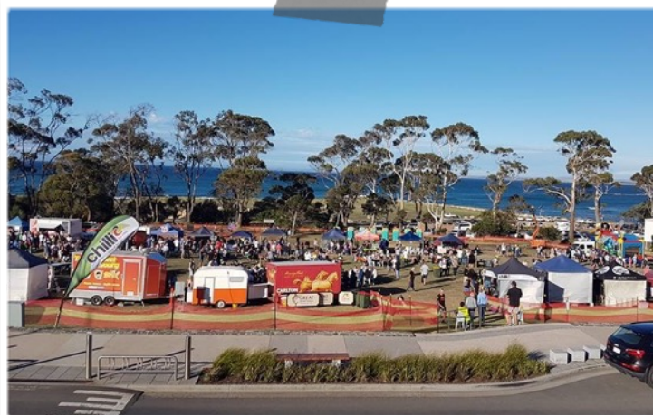
The sun shone on yet another successful End of Summer Party

It's great to see people enjoy a fun family night out and we look forward to The End of Summer Party in 2019.