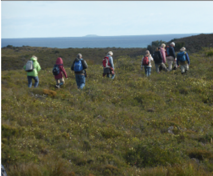
Field Nats heading out across the heathlands in the Waterhouse Conservation Area.

We are still doing our battery collection so if any body has any please bring them up to the men's shed . Stay Safe Denise Waters Ph 0407 111 111