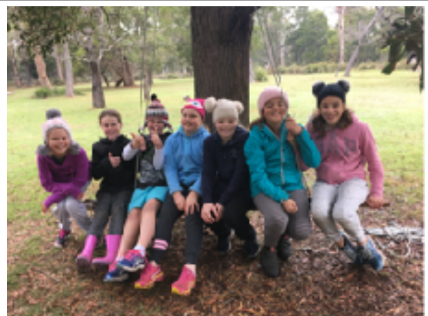
Happy Campers (Girl Guide Info Pg 3)