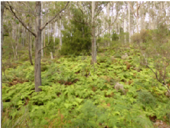
Picture shows the lush fern understory along the side of the rail trail near Kamona Siding.