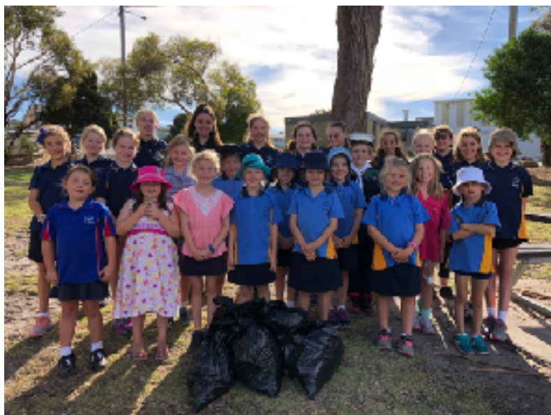
Girl Guides with collection of rubbish from Clean Up Australia Day

HAVE YOU HAD THE OPPORTUNITY TO REVIEW THE LATEST INITIATIVE AT THE SCHOOL? ASK THE CHILDREN!