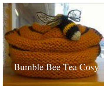
Bumble Bee Tea Cosy

Tidy Towns – Speaking of litter and environment we entered this year for the first time for over a decade. We were runners up in the small town category and received wide ranging commendations from the judging panel. The title is a misnomer in that the award focuses on strategic environmental and social sustainability of communities rather than traditional "tidiness". Our success again points to the importance of maintaining our environmental qualities as a key factor in for future economic and social prosperity.