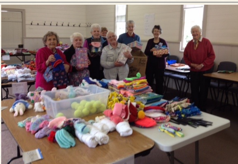
Scottsdale Craft Group, known as "Sew Many Hands, So Much Need", enjoying community, as they pack their Operation Christmas Child boxes at the Gospel Hall, Scottsdale last month.