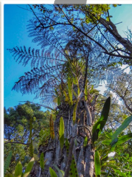
The large and spreading Stringy Gum near the Brid River is estimated to be at least 350 years old and about 50 metres high.

Ring Jill van den Bosch on 0429 644 329 for more details or to register your interest in attending.