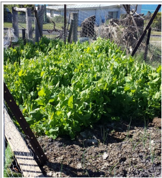
Malcom's flourishing crop of peas.