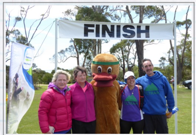
Last year's winning team from Hobart, pose with Rivers Festival Mascot, Puggles

Registrations from 12 year olds up will be taken on the Village Green from 8 am on the day before the 10 am start.