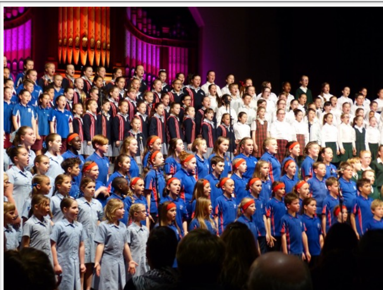
The Bridport Primary School Choir performing in the massed choir at Singfest at the Albert Hall in September.

Bridport Primary School Choir once again represented the school magnificently at Singfest last month. The children sang eight songs in the massed choir of over 300 students from eight schools. As their individual item, the choir sang Don Gato, a Mexican folk song about a lovesick cat who comes to an untimely end after falling from a rooftop. There was much sobbing into colourful hankies (thank you to the Mums, Nans and students who made those), and wailing meows as Don Gato succumbed to his injuries. Fortunately, the song had a happy ending with a miraculous recovery and a rousing Ole!