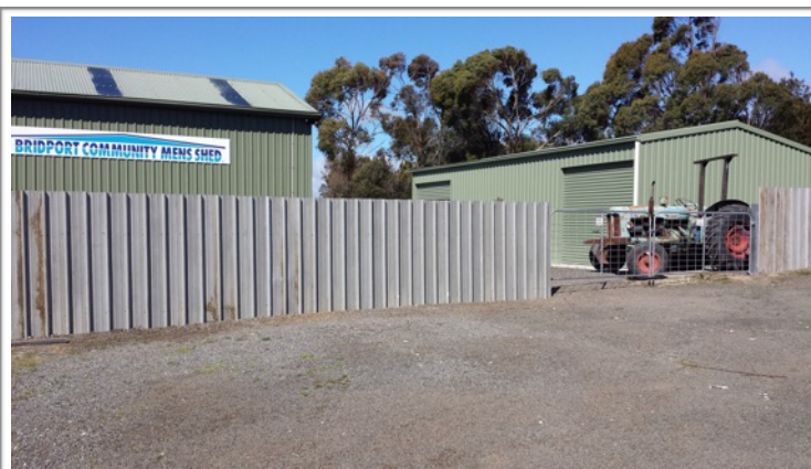
Progressing fence - the fence construction is underway.