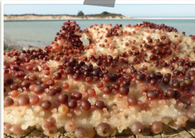
Giant Pimply Sheets, found along Policeman's Point.