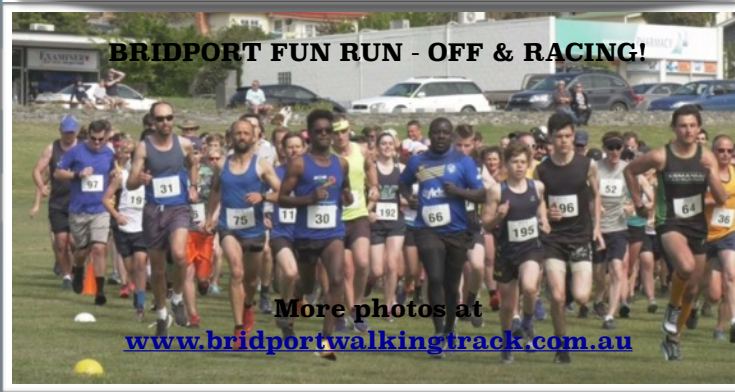
BRIDPORT FUN RUN - OFF & RACING!

More photos at www.bridportwalkingtrack.com.au