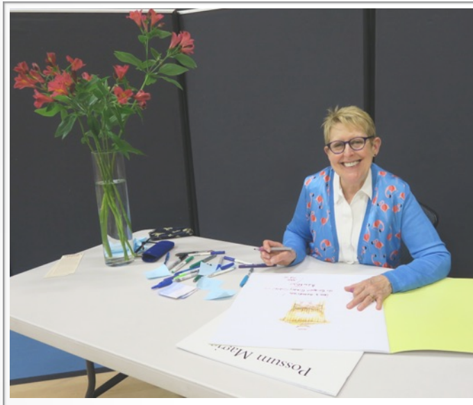
Author Mem fox, signing books at Bridport Primary School.

On Thursday 26th October, world-renowned author Mem Fox presented an information session for parents, families, and community members entitled "Teachers or parents? Who's in charge of literacy learning?" It was an amazing opportunity for community members to be informed and entertained by such an engaging speaker. Everyone was able to learn some of the skills needed to work together to support children on their literacy learning journey.