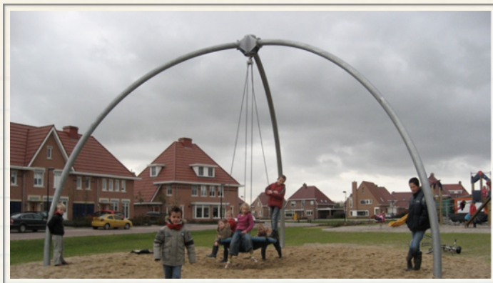
An example of the Giant Swing with Bird's Nest as part of the Bridport Community Playground.

Thanks must go to the Lions Club of Bridport and the Tasmanian Community Fund for providing funding that will help to make this project become a reality! Council are currently seeking quotes from playground suppliers and installers, with construction works for Stage 1 of the playground expected to commence around February 2017 and be completed before winter sets in again next year.