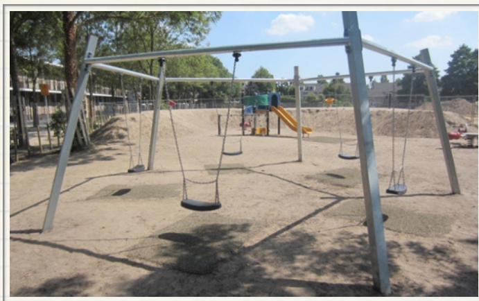
The Five Way Swing will no doubt be a favourite for locals and visitors.