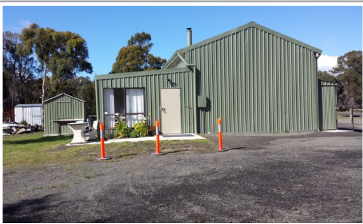
Looking good - the Men's Shed is open most days. Come along and have a look, chat or cuppa.