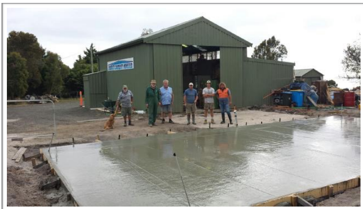
Under construction - the slab is setting for the next stage of the metal shed.