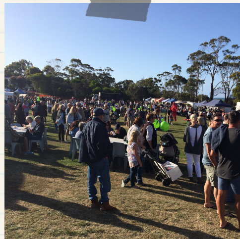
A beautiful day for a Summer Party.