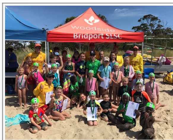
The Bridport SLSC Nippers at the Club Championships.

A big thank you to the nipper parents, club members, beach patrol teams, age managers, coaches and junior activities coordinators for making the 2016/17 nippers program a great one!