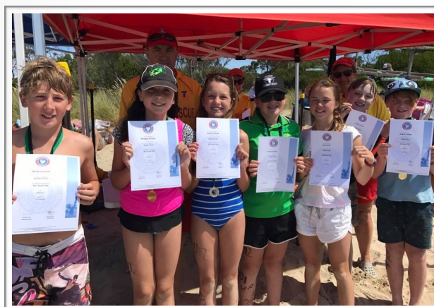
Surf Smart - The U12s proudly displaying their surf education awards - Surf Smart One.