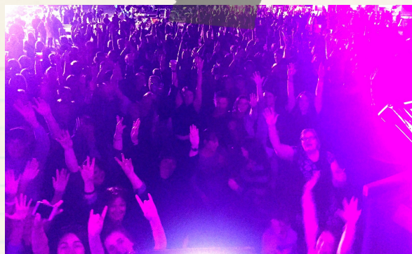
The crowd dancing the night away to Gypsy Rose.

The Bridport End of Summer Party is on again in 2018. The Events committee will be holding two major fundraising events during the year to keep the summer party improving and growing. Follow them on Facebook for updates @eventsatbridport.