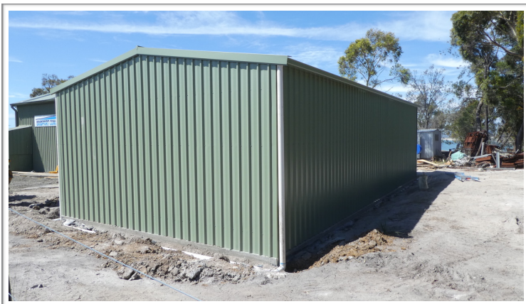
Finally the metal shed stands ready to go.