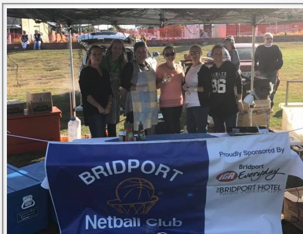
The Bridport Netball Club at their sliders and chips stall at the End Of Summer Party.