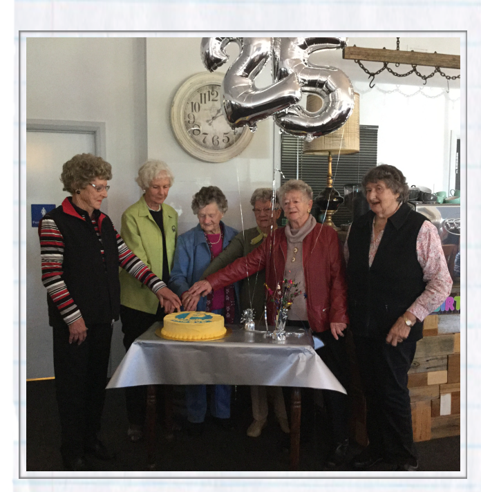
Bridport Combined Probus Group foundation members cut the cake celebrating 25 years.

PHONE OR TEXT FOR ENQUIRIES OR AN APPOINTMENT 0408522005