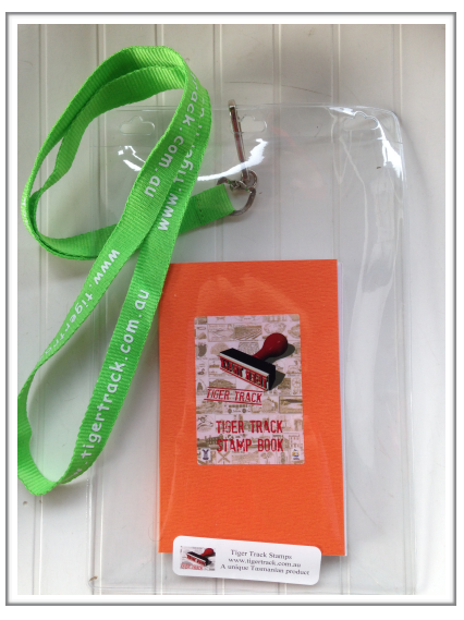
A specially produced stamp collecting booklet comes in a kit in a pouch on a lanyard.

More information can be found on the web site www.tigertrack.com.au or by phoning Kaye on 0412440364.