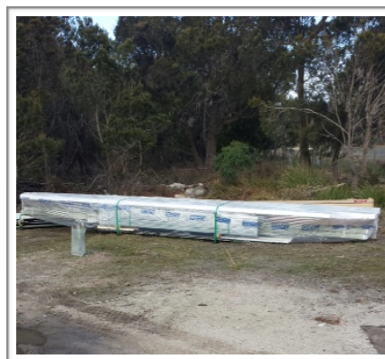
The newly donated shed ready to be erected.