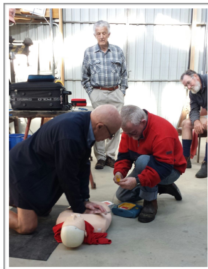
Men from the Community Men's Shed learning how to use the defibrillator at the Demo Day.