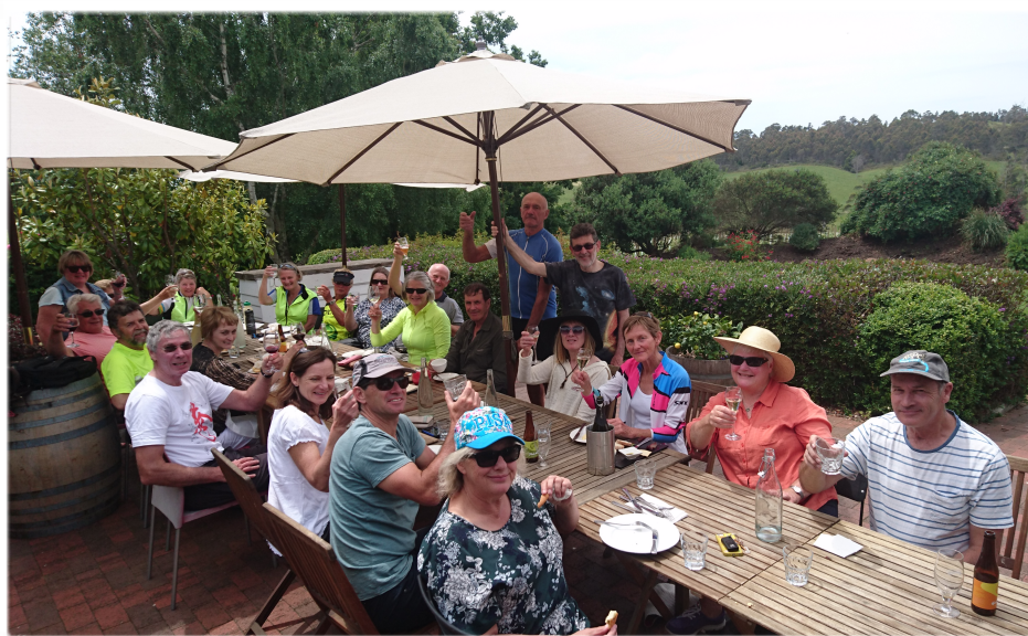
DBug Lunching at Bay of Fires winery on their final outing for 2016.