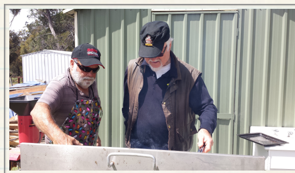
(Top) The two Bobs on duty. (Below) Loading timber donation to Exeter shed from Bridport.