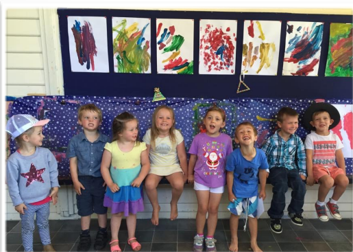
The Play Centre kids show off their paintings, after a great year of learning and playing at the "Blue School"