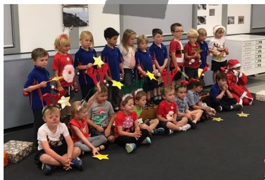
The Bridport Primary School Kindergarten Class put on a wonderful Christmas Concert for their families and friends.