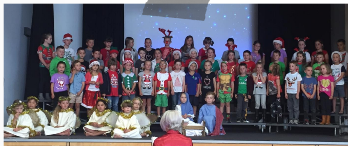
The Bridport Primary School Prep, Grade 1 & 2 classes performed the Nativity at the end of year Christmas Assembly in December.