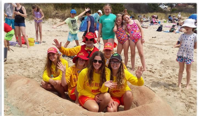
Young Surf Lifesavers sculpt a rescue boat in the sand building competition.

Programs will be available closer to the day.