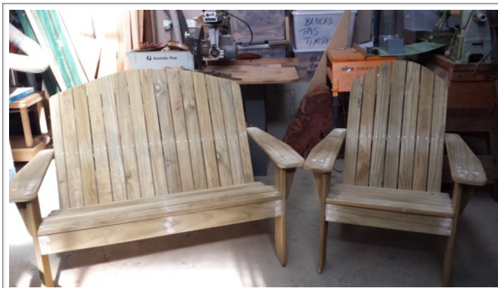
Peter's timber garden setting project is almost complete and looking very good.