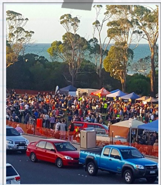
Last year's End of Summer Party - over a thousand people flocked to the Village Green to celebrate.

DON'T FORGET - BRIDPORT CWA MARKETS - SATURDAY 3rd FEBRUARY