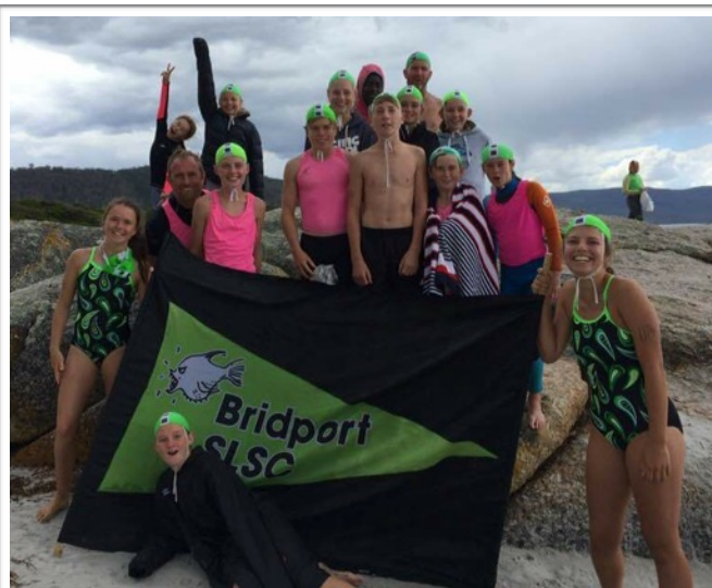
The Bridport SLSC Junior Surf Sports Team at the Statewide Junior Carnival in Bicheno in January.

In the meantime get excited for the upcoming Surf Life Saving Tasmania Statewide Carnival being held at Bridport SLSC. The Masters Carnival will be held on Saturday 17th February followed by a BBQ dinner and drinks at the club and the Junior and Open Carnival on the Sunday 18th February. We'd love to see you there!