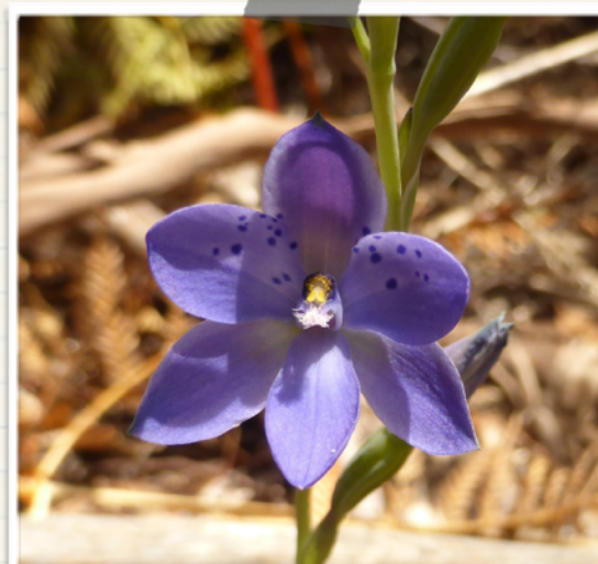
Field Nats reported seeing the blue spotted sun orchids, Thelymitra sp. which was in full blown.

Contact Lou Brooker at brooker@vision.net.au or phone 0417 149 244 for more details.