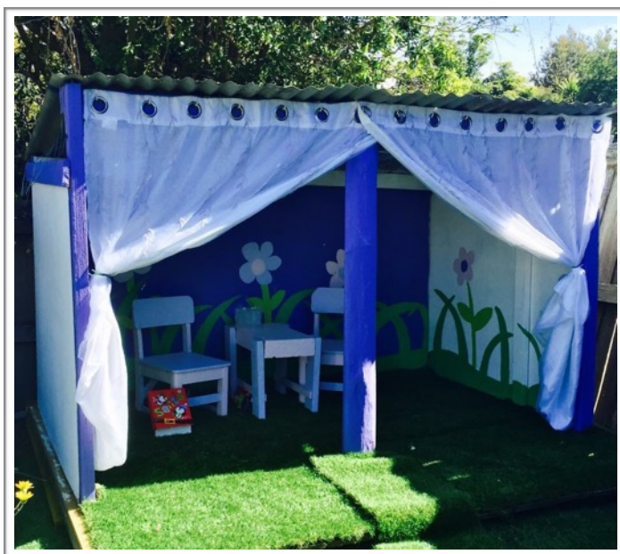
The perfect Play House - One of the many projects the men and lady shedders put their hands to.