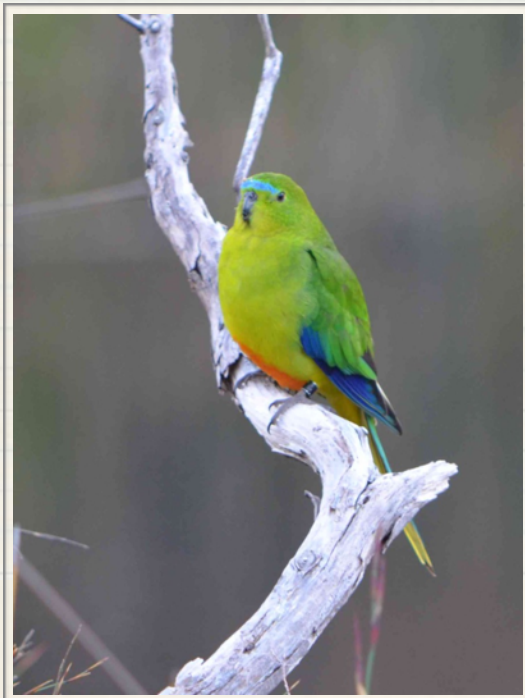
Orange Bellied Parrots come to Melaleuca in Tasmania's South West in the summer to feed and breed, they are one of the world's most critically endangered birds.

Newcomers are welcome. Please contact Lou Brooker on 0417 149 244.