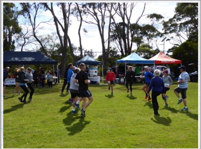
Participants limber up before the start of last year's fun run ready to run the 10+ kilometres along the Bridport Walking Track.

Registrations from 12 year olds up will be taken on the day from 8 am on Sunday 29 October at the Village Green where the starter's gun will sound at 10 am.