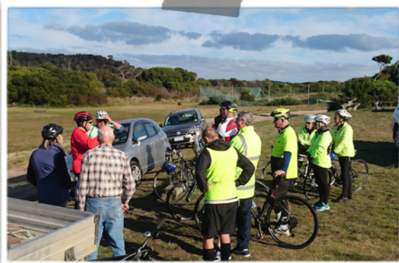
DBUG riders get ready to set off for last month's ride.