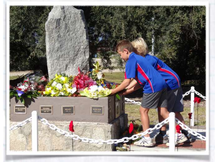
Bridport Primary students lay a wreath at the cenotaph at last year's ANZAC Day Ceremony.

"They shall grow not old, as we that are left grow old; Age shall not weary them, nor the years condemn. At the going down of the sun and in the morning We will remember them."