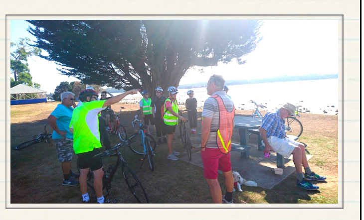
DBug riders planning the route at Beauty Point.