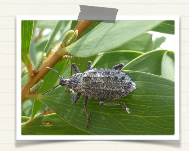
No luck finding the Crusader Bug but the group were able to spot this little fellow, the "Boobyalla Weevil".

What was found, though was a flightless weevil named Leptopius duponti. So far this weevil has no common name, but is being referred to for now, as the 'boobyalla weevil'