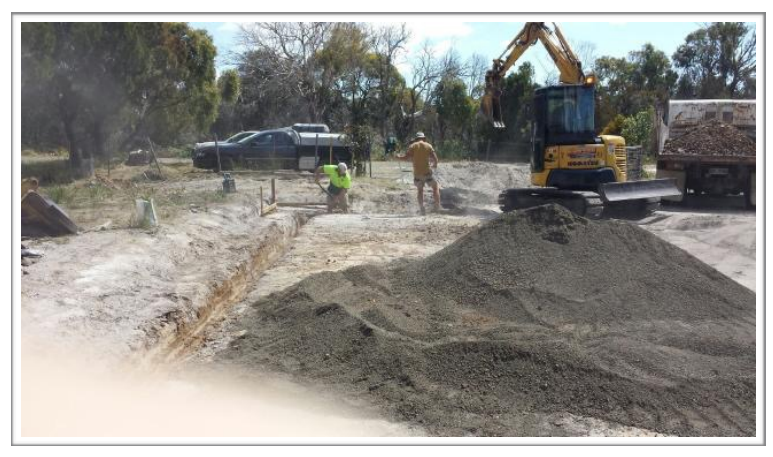
Preparing the slab for the new shed which is now complete ready for the official grand opening on the 10th April.