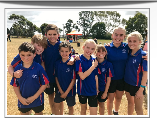
Bridport Primary School grade 5 & 6 students ready for the relay event at the North East Schools Athletic Carnival held recently. Those students who have performed well will go to St Helens this month to participate at the East North East Schools Athletic Carnival. We wish them all the best!

Wednesday 26<sup>th</sup> April - 9am - 4:30pm <u>"Circscool"</u> (Numbers are limited). Rock Climbing & Circus Skills in Launceston. Learn how to climb and boulder at Circscool, then after lunch try a variety of different circus skills such as juggling, balancing, hoops, etc.